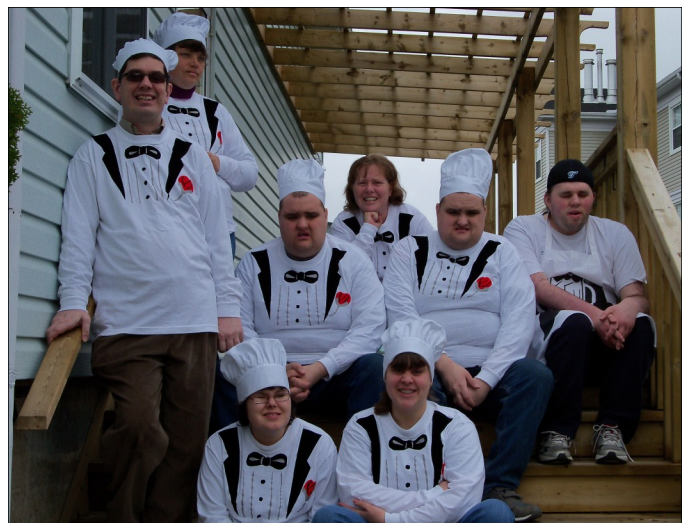
The Lite Lunch staff take a break from a busy day to pose for a recent picture at Activities Plus.

For more information visit www.mvacl.ca , call us at (613) 756-3817, or drop by the office and fill out a membership application.